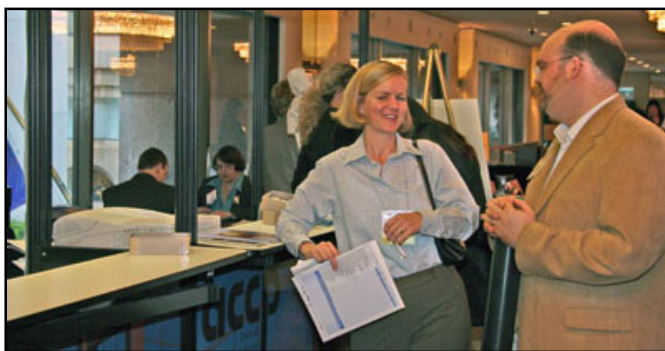
There are many opportunities at the ACCP Annual Meeting to reconnect with friends or meet new ones.