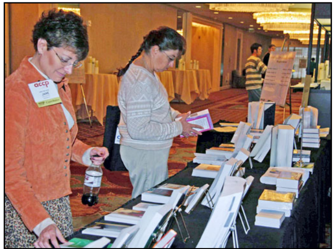
Be sure to stop by the ACCP Bookstore at the 2006 Annual Meeting and check out the latest titles.