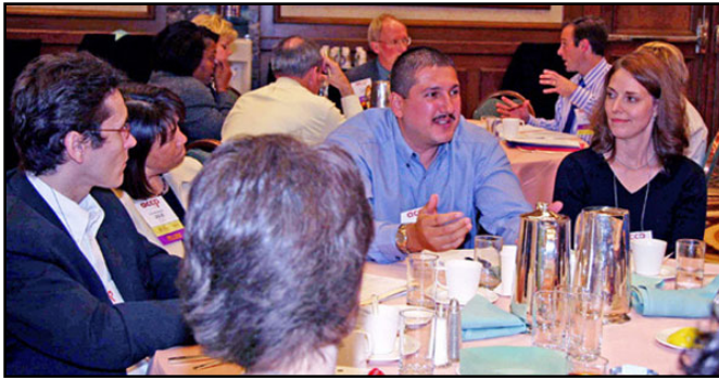
The important work of ACCP's committees begins at the Annual Meeting and continues throughout the year.