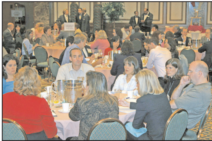
Attendees enjoy the activities at the 2005 ACCP Annual Meeting, which was held in San Francisco, California.

See this page for a schedule of all PRN focus sessions at the Spring Practice and Research Forum. For more focus session details, go to the detailed meeting agenda online at http://www.accp.com/sf06agenda.php .