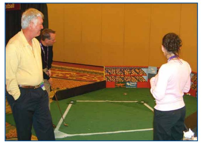
PRN members putt away at the Research Institute Silent Auction/PRN Reception in St. Louis, Mo.