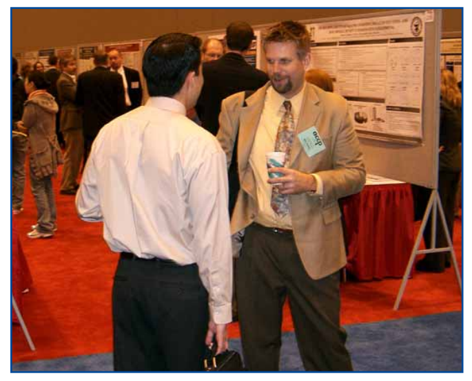
Attendees stop to talk during a poster session at the 2006 ACCP Annual Meeting, which was held in St. Louis, Mo.