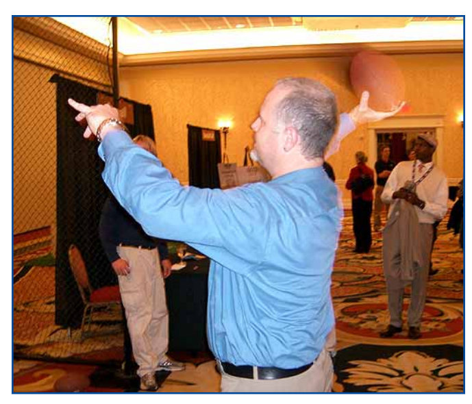
A football-throwing challenge was one of many sports-related games at ACCP Research Institute Silent Auction/PRN Reception held at the 2006 Annual Meeting in St. Louis, Mo.

October 19-22, 2008 ACCP Annual Meeting; Louisville, KY